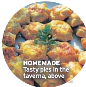
HOMEMADE Tasty pies in the taverna, above