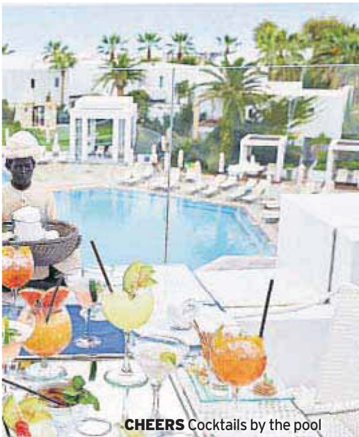
CHEERS Cocktails by the pool