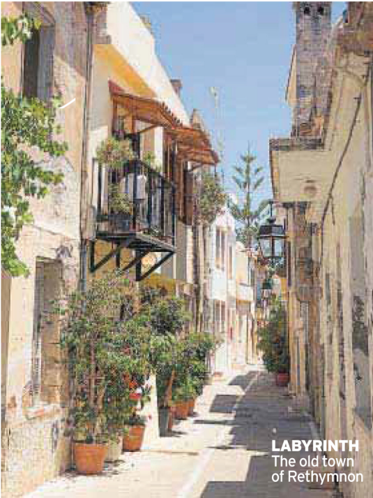
LABYRINTH The old town of Rethymno